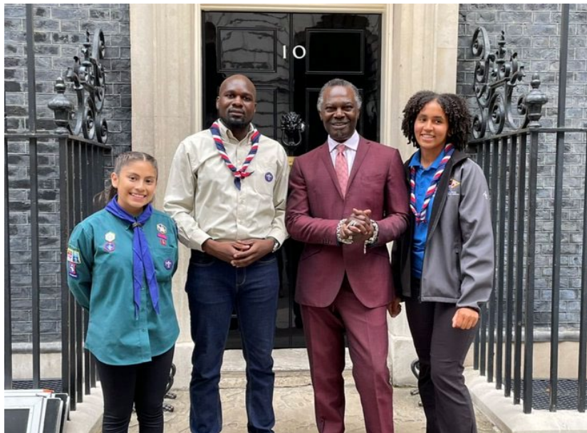
Scout Ambassador, polar explorer and TV presenter, Dwayne Fields, (second from left) with celebrity chef Levi Roots (third from left) with our Scouts at 10 Downing Street, London.