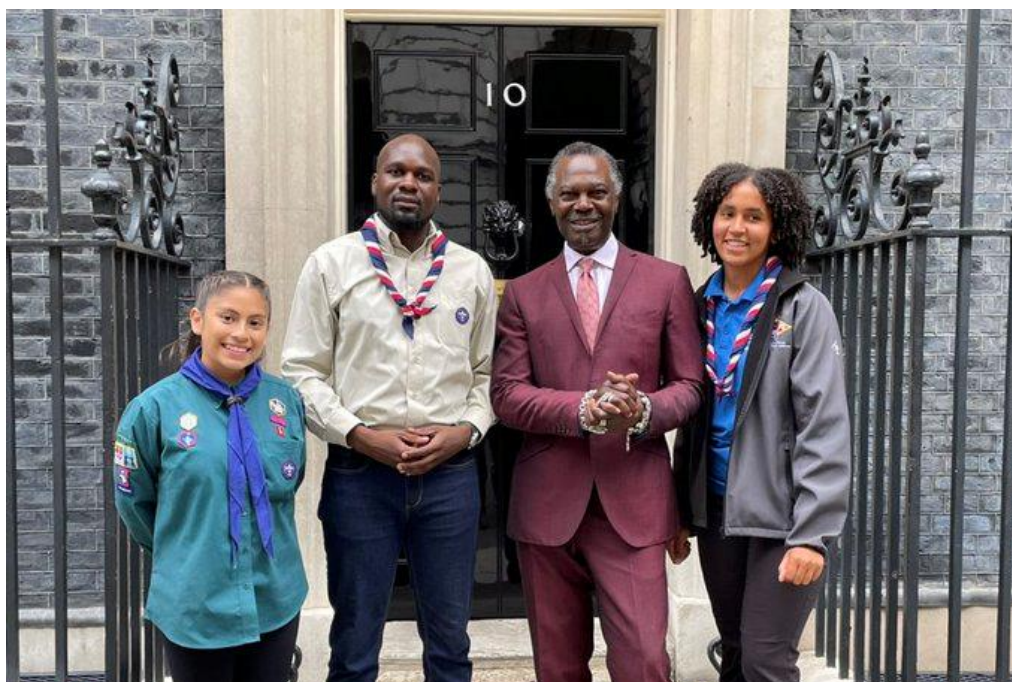
Scout Ambassador, Dwayne Fields, Polar Explorer & TV Presenter (second from left) with celebrity chef Levi Roots (third from left) with our Scouts at 10 Downing Street, London UK